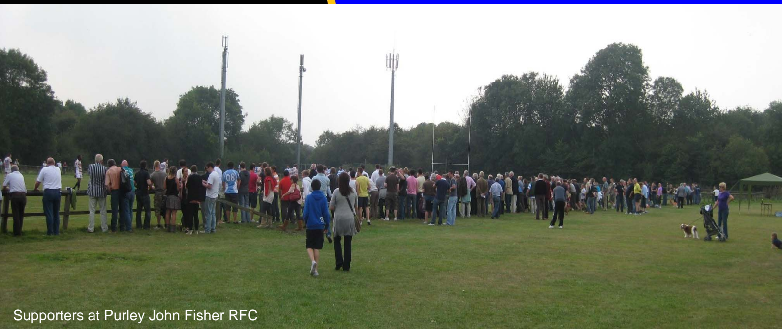
Supporters at Purley John Fisher RFC